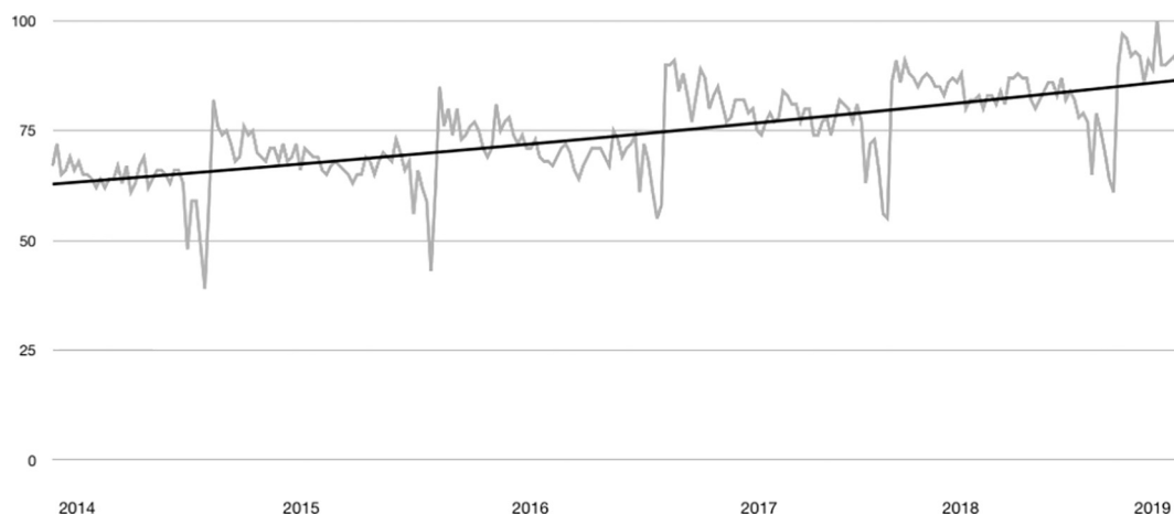
Fig. 1. Search trends on “healthy diet” in Google Trends report (2014–2019).

The rapid growth of the number of users who create profiles in social networks and the extensive use of different social platforms to generate content around different topics resulted in social networks has